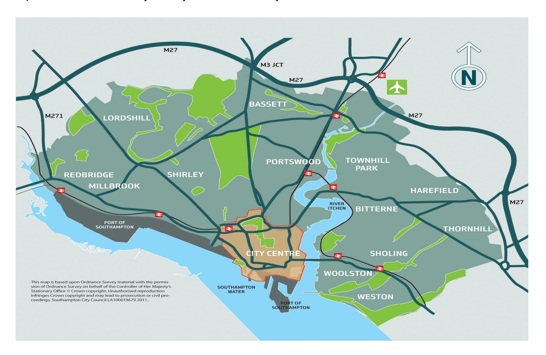
Map 1 The administrative boundary of the city and the extent of the city centre